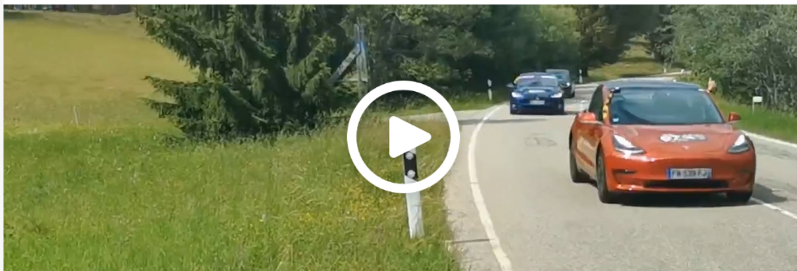
Video of the teams crossing the lap counter line in the last minutes of the race