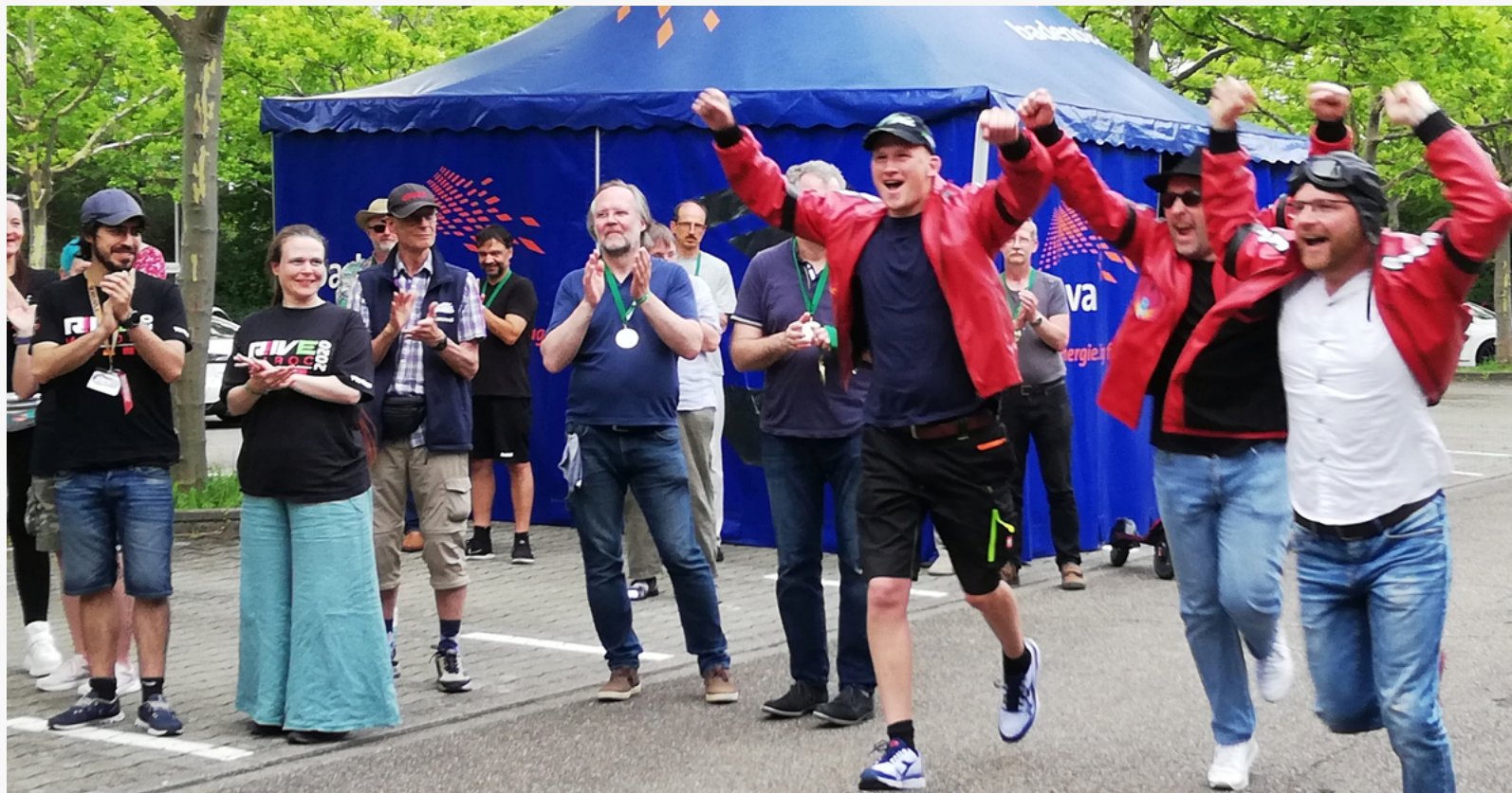
The winners of eco Grand Prix Schauinsland 2020