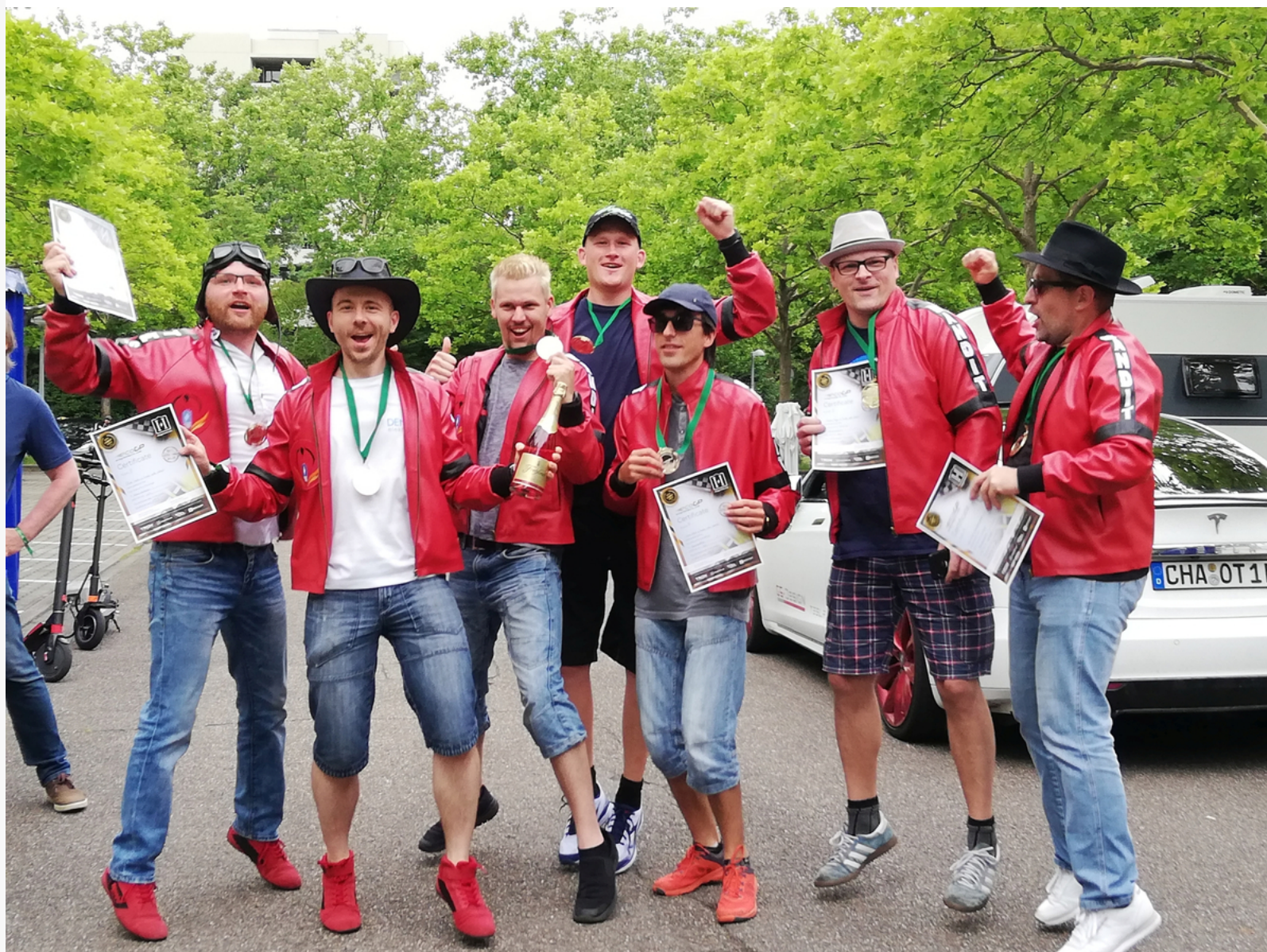
"The Red Jackets" - Two teams of In-Produkt Denkt Elektrisch win 1st and 3rd place

All drivers collected GP points. This is the actual driver ranking after the first of three races in the Season 2020.