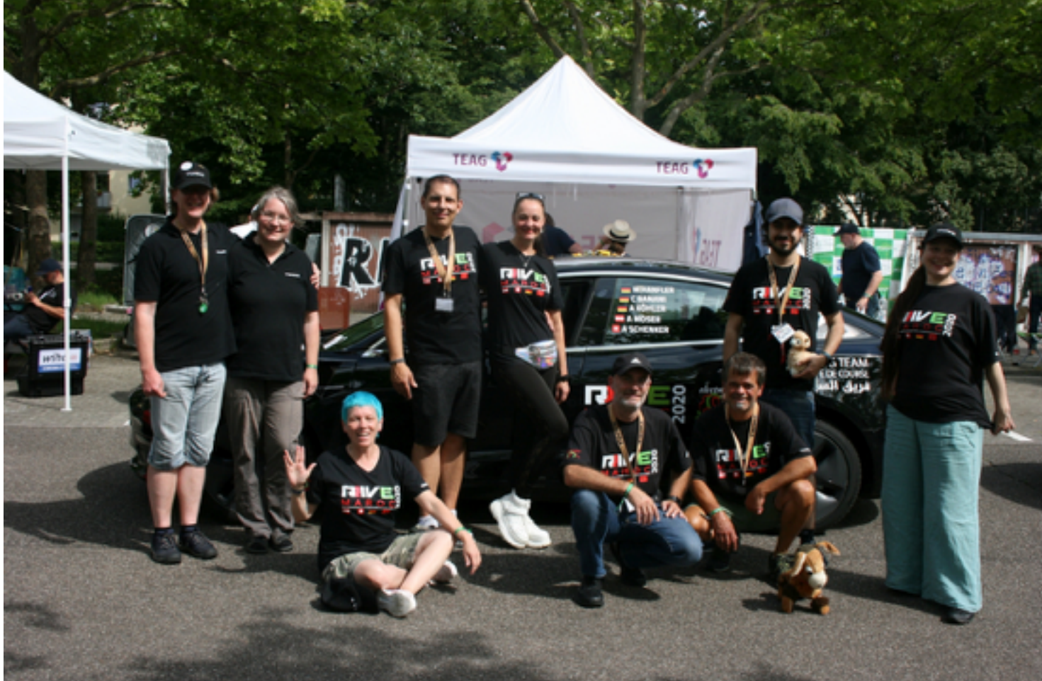
Team RIVE Maroc - Schauinsland Race 2020