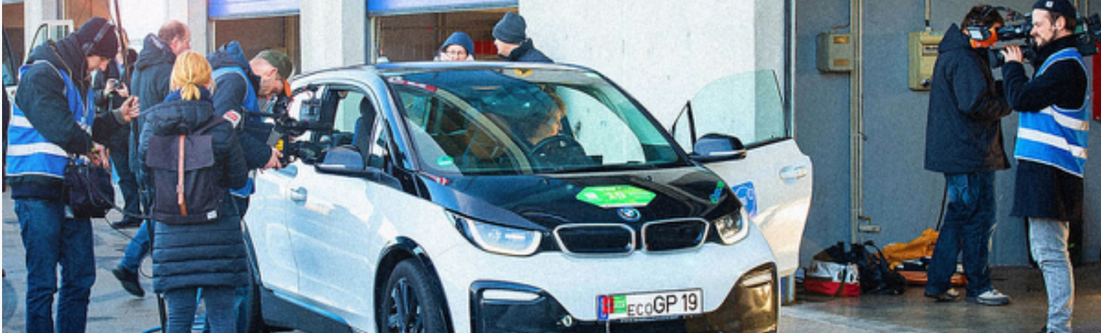
Jutta Kleinschmidt am Steuer von eco Grand Prix Team 19 im BMW i3

As Jutta Kleinschmidt 2018 said in a TV interview, the competition is very tactical. The winner depends less on the vehicle, it is more the sophisticated strategy and the team that makes the winner.