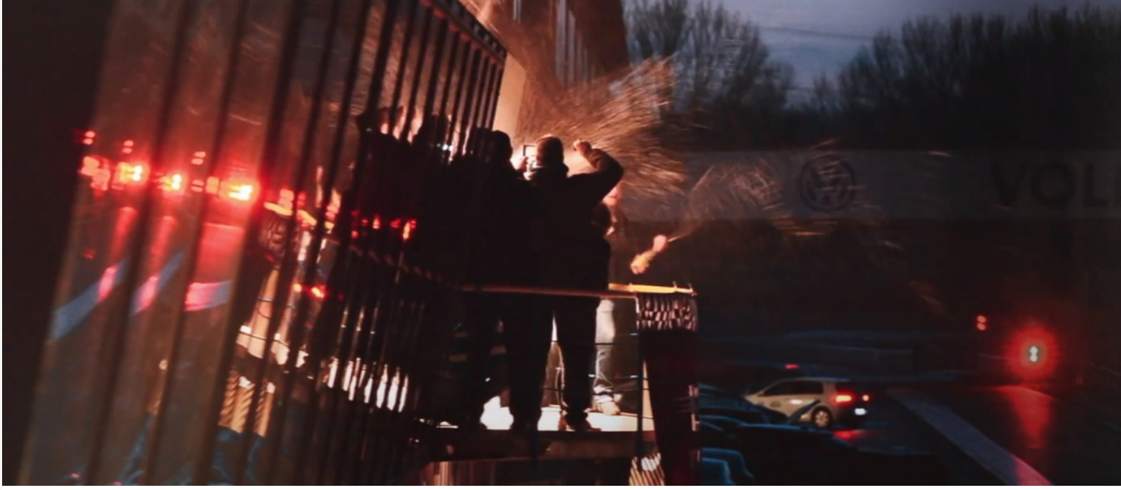
Award ceremony eco Grand Prix Oschersleben.